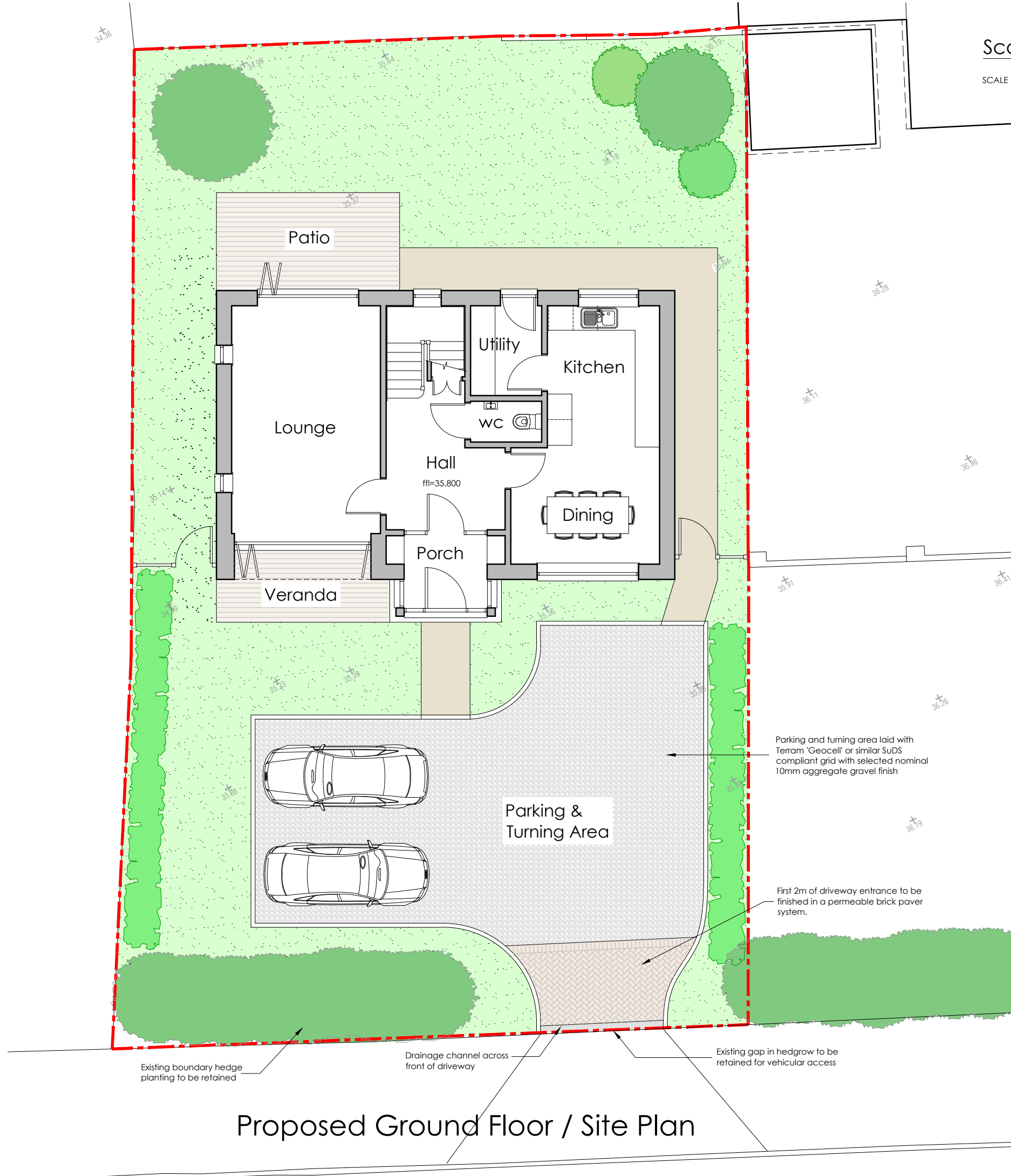
Proposed Ground Floor / Site Plan